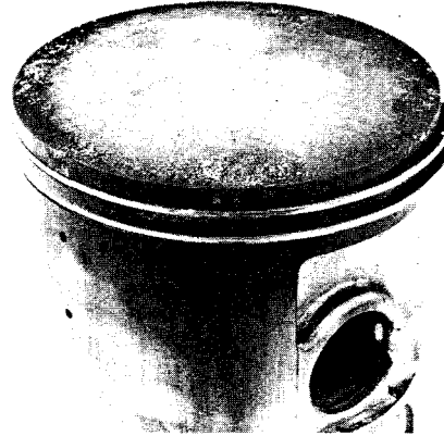
20:1 Our baseline premix ratio produced 26.9 bhp and the light coating of piston varnish seen here.

The choice of test engines was based on practical considerations, foremost among them reliability. We didn't want some mechanical failure to abort a test. And we wanted to use a 250cc singlecylinder engine because that's a representative size-and because a single presented the fewest problems in terms of top-end dismantling. The plan was to run a new piston in each series of tests so we'd have no confusion over which premix ratio created the most varnish and/or carbon deposits around the top of the piston and the ring grooves. Finally, we had to consider the possibility of a seizure severe enough to damage the cylinder bore, something that would require a cylinder replacement.