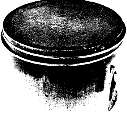
15:1 Adding oil reduced varnishing and raised the output 3.7 bhp over that obtained on 30:1 premix CYCLE

Earlier we'd decided to run for 30 minutes with plug-washer and cylinder-head