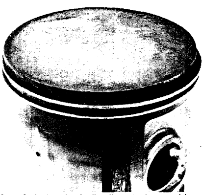
30:1 Reducing the fuel's oil content caused heavy scuffing, more varnish and a 12 percent power loss.

With the above horsepower baseline established the endurance testing (for us and the Suzuki) was begun. We somewhat arbitrarily decided to run the engine at 5500 rpm, and throttle and load were jiggled to bring plug temperatures into the 390–400 degree F. range. The load re-